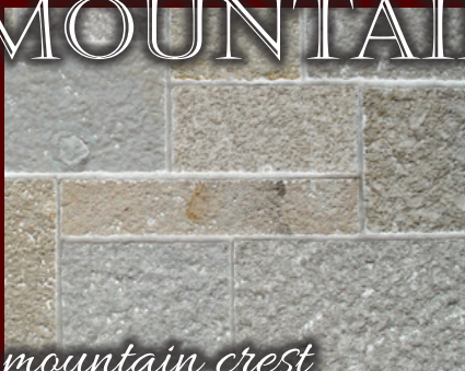
mountain crest ROYAL CHATEAU®