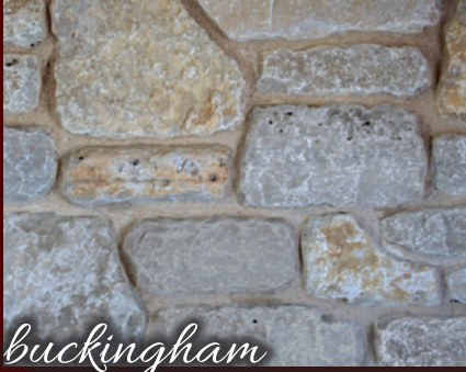
buckingham HERITAGE ANTIQUE®