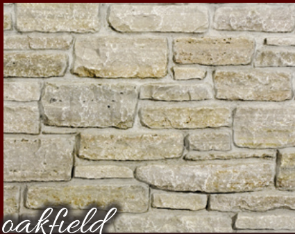
oakfield MACHINE CUT VENEER TUMBLED