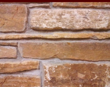
WEATHERED BAGO® NO RED