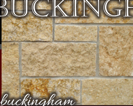
buckingham ROYAL CHATEAU®