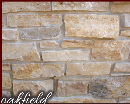
oakfield WEATHERED EDGE