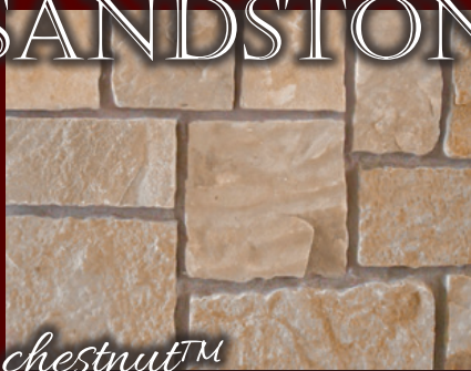
chestnut™ RUSTIC ROYAL CHATEAU®