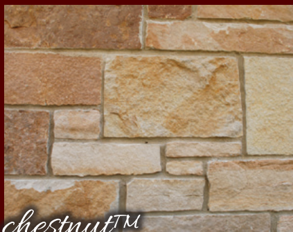
chestnut™ COUNTRY MANOR®