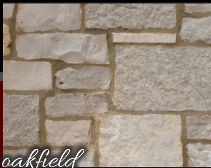
oakfield COUNTRY MANOR®