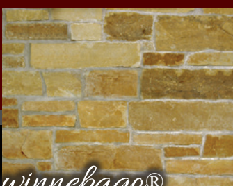
winnebago® WEATHERED EDGE