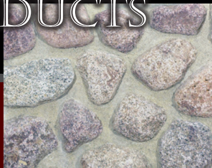
ROUND SIDE OUT GRANITE BOULDERS