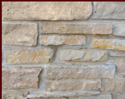
FOND DU LAC WEATHERED EDGE