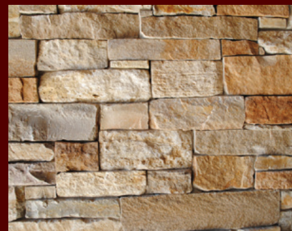
CUSTOM WEATHERED BAGO®