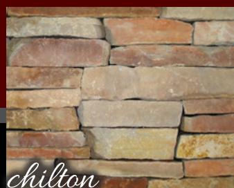
MACHINE CUT VENEER LEDGESTONE