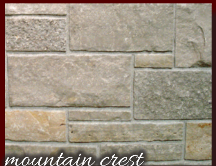
mountain crest COUNTRY MANOR®