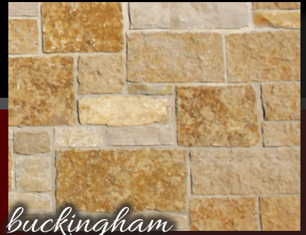
buckingham COUNTRY MANOR®