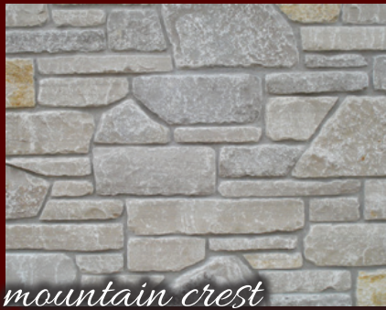
mountain crest HERITAGE ANTIQUE®