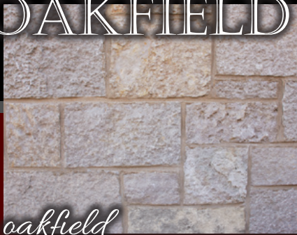
oakfield RUSTIC ROYAL CHATEAU®