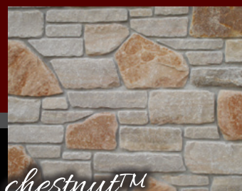
chestnut™ HERITAGE ANTIQUE®