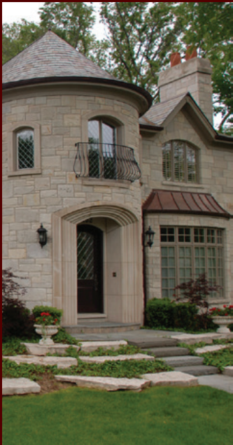
EDEN ROYAL CHATEAU