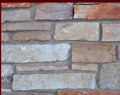
JERICO™ NO RED