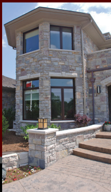
CHILTON COUNTRY MANOR