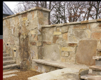
PALAMINO WITH WINDSOR