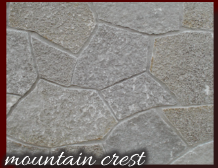
mountain crest WEBSTONE