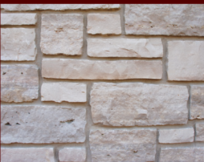
FOND DU LAC MACHINE CUT VENEER