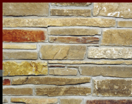
WEATHERED BAGO® WITH RED