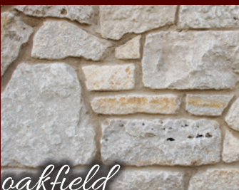
oakfield HERITAGE ANTIQUE®