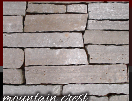
mountain crest MACHINE CUT VENEER LEDGESTONE