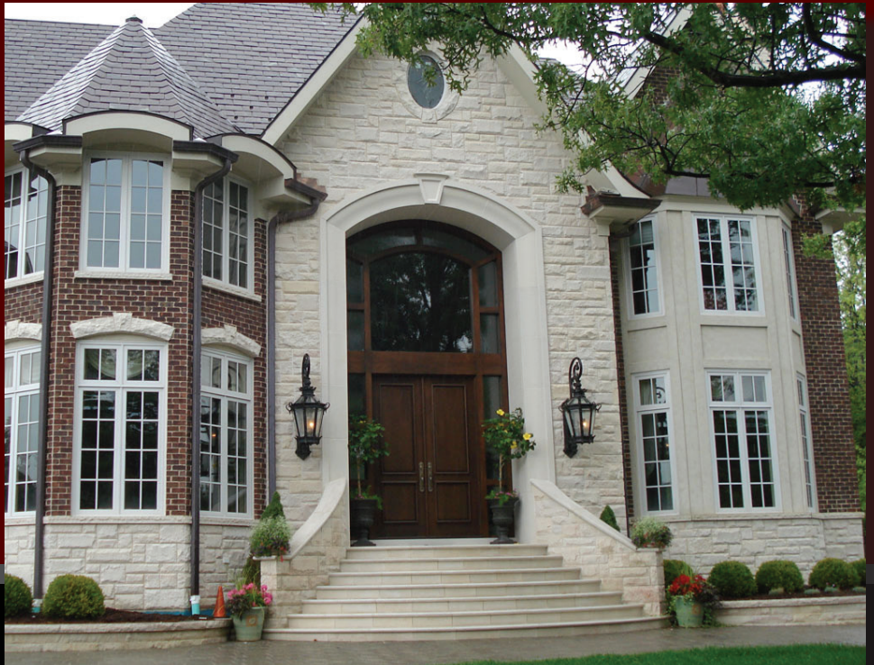
VALDERS DOVEWHITE ROCKFACE