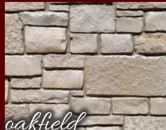
oakfield CHAMPAGNE BLEND