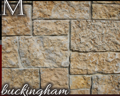
buckingham RUSTIC ROYAL CHATEAU®