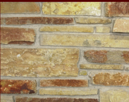
JERICO™ WITH RED