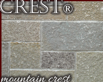
mountain crest RUSTIC ROYAL CHATEAU®