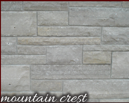
mountain crest MACHINE CUT VENEER