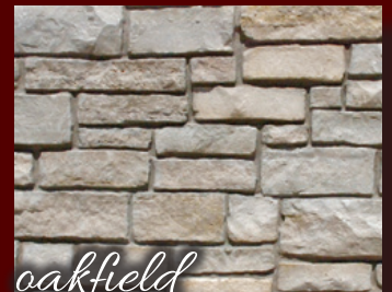
oakfield CHAMPAGNE COBBLE