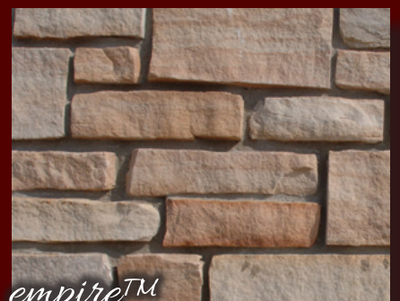
empire™ MACHINE CUT VENEER