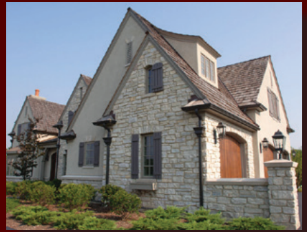
OAKFIELD MACHINE CUT VENEER TUMBLED