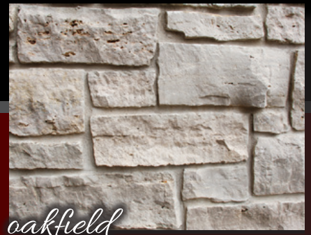
oakfield MACHINE CUT VENEER