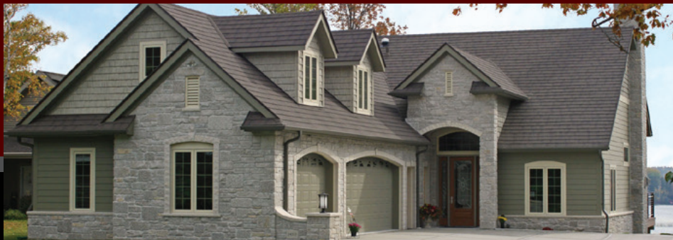
MOUNTAIN CREST COUNTRY MANOR TUMBLED